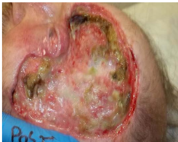
Fig.D. After 3 months of Enluxtra, wound edges appear healthy, and all dimensions are smaller