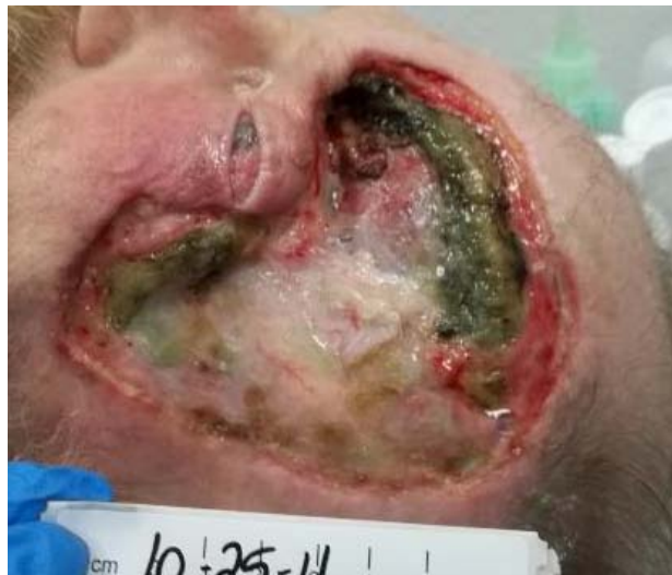
Fig. B. Two weeks following initial use of Enluxtra, sinus drainage is controlled and pink granulation buds are present in the wound bed