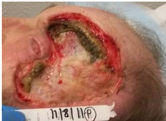
Fig.C. After 1 month's use of Enluxtra, the need for debridement was drastically reduced and the thin tissue over the brain remained optimally moist and granulated